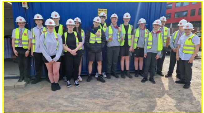
Taith Adeiladwaith i'r Neuadd Chwaraeon Newydd / Construction trip to the new Sport's Hall.