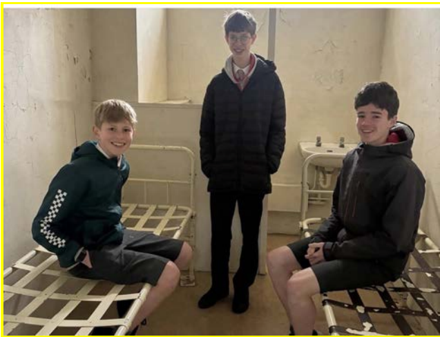
Taith Hanes (Blwyddyn 10) a Throseddeg (Blwyddyn 12) i garchar Shepton Malett / History Trip (Year 10) and Criminology Trip (Year 12) to Shepton Malott Prison.