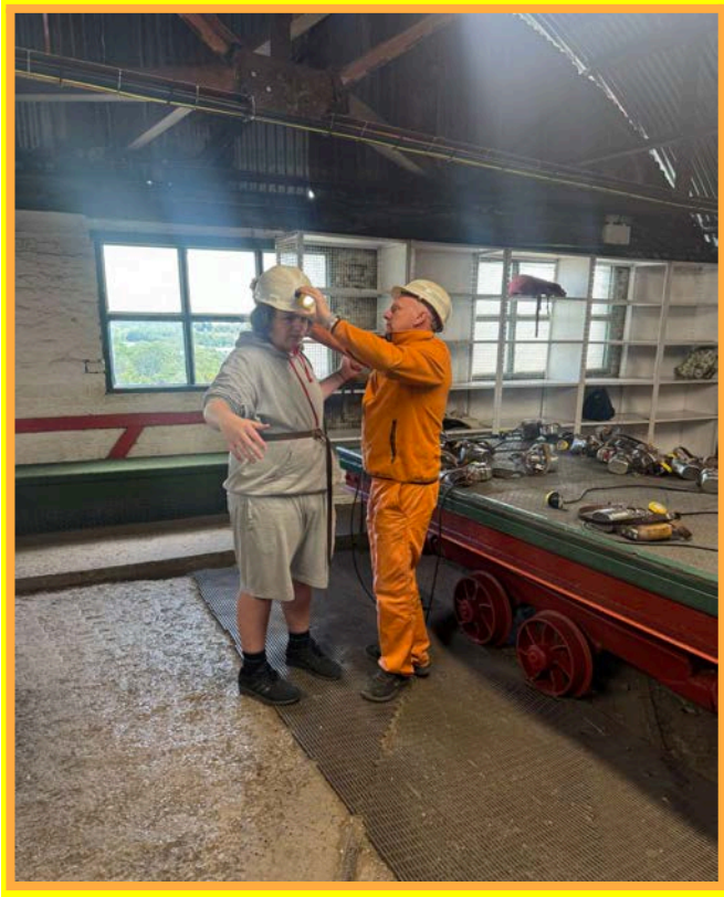
Taith y Hafren i'r Pwll Mawr / The Hafren trip to the Big Pit.