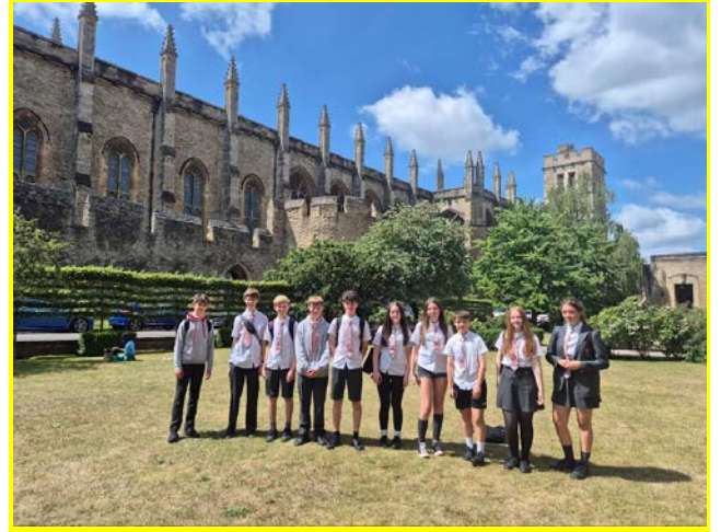
Taith Catalyst Cymru i Rydychen / Welsh Catalyst Trip to Oxford University.