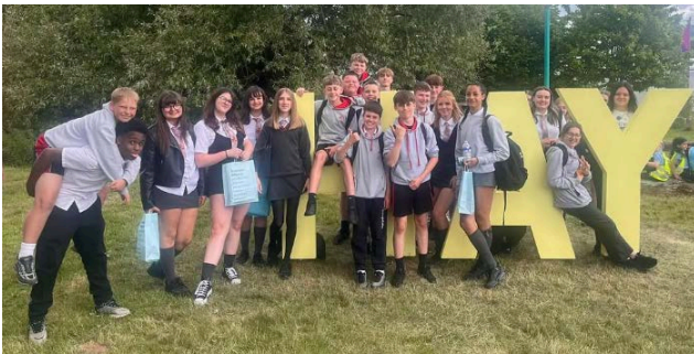
Taith Blwyddyn 9 o'r Gwyl y Gelli Gandryll / Year 9 Trip to the Hay on Wye Festival.