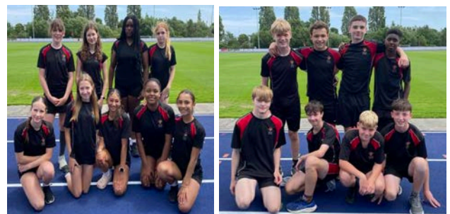
Bechgyn Bl. 7-10 yn 5ed yn Ne Cymru, Merched Bl. 7 - 8 yn 4ydd / Years 7-10 came 5th in South Wales and Years 7-8 Girls came 4th.