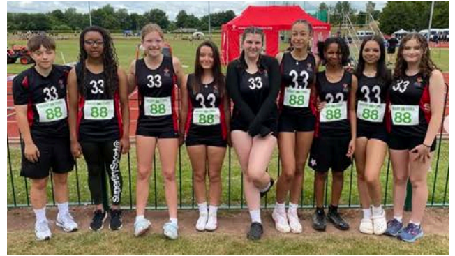
Tîm athletau merched o dan 16 yn 4ydd yn Plât Cymru / Girls Under 16 Athletics Team came 4th in the Welsh Plate.