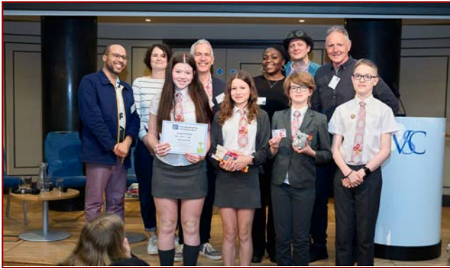
Taith Blwyddyn 8 i'r National Literacy Trust (Rownd Terfynol y Cystadlaeth) / Year 8 trip to the National Literacy Trust (Grand Final) - Best Newcomers.