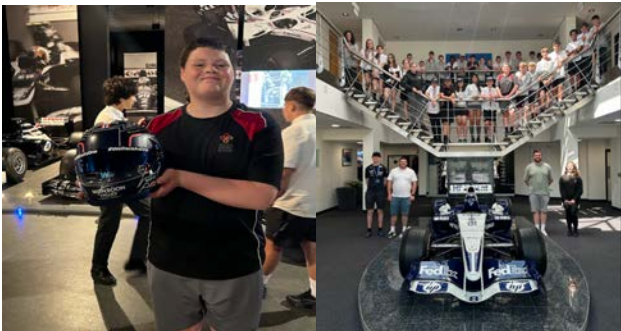
Taith Blwyddyn 9 i Williams Racing / Year 9 trip to William Racing.