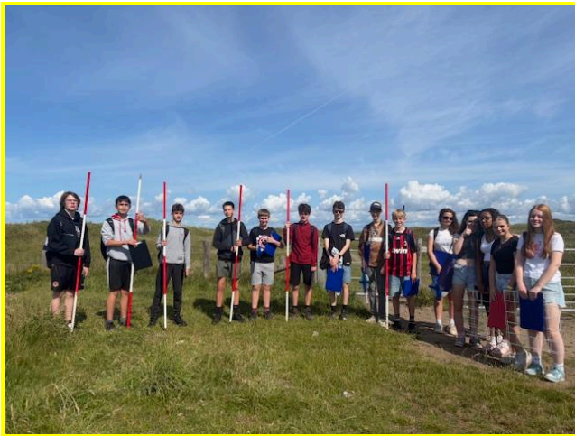
Gwaith maes Daearyddiaeth TGAU BI.10 Kenfig ac Aberafan / Geography Field Work BI.10 GCSE